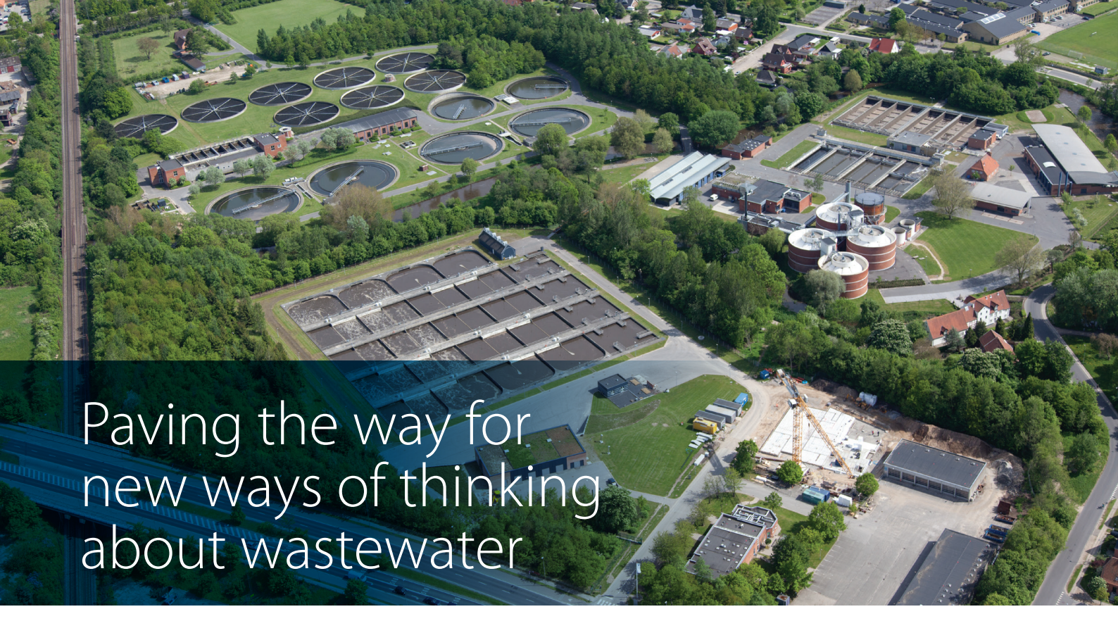
Ejby Mølle WRRF.

Wasterwater treatment as resource generating – rather than a resource consuming process. This is the philosophy at Ejby Mølle, the largest Water Ressource Recovery Facility (WRRF) at VCS Denmark.